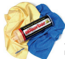
TAN / BLUE

ABSORBENT: Spend less time drying and more time enjoying life