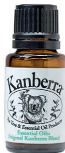
KANBERRA TEA TREE ESSENTIAL OIL