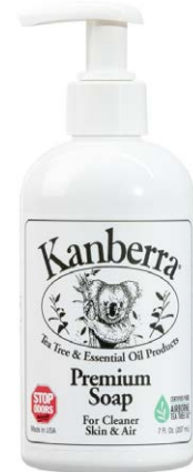
KANBERRA PREMIUM SOAP MADE WITH TEA TREE OIL