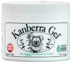
KANBERRA GEL (THE ORIGINAL) ALL-NATURAL AIR PURIFIER