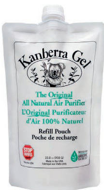
KANBERRA GEL REFILL POUCH 24OZ