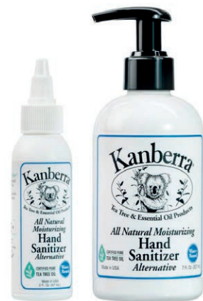
KANBERRA ALL-NATURAL MOISTURIZING HAND SANITIZER ALTERNATIVE MADE WITH REAL TEA TREE OIL